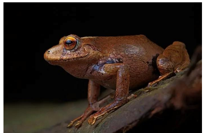
P. nunezcortez – the smallest of the three new frog species.