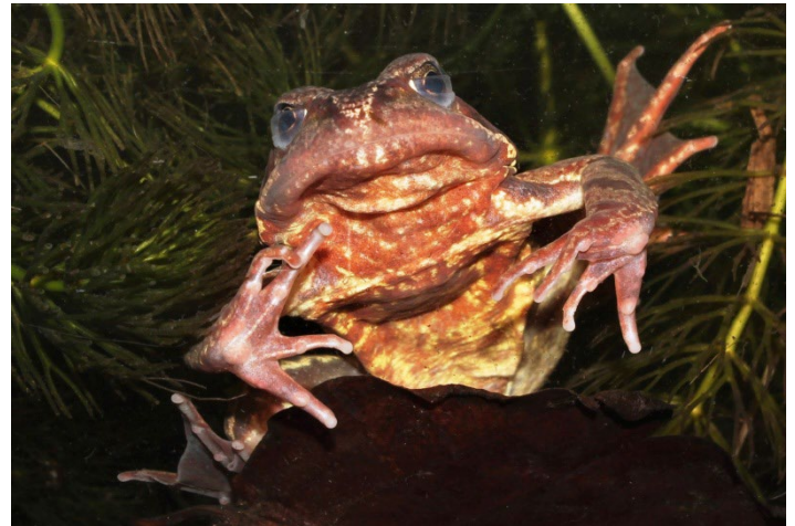
Ringland, Norfolk Rana temporaria 15/4/2019 ABOVE swimming female with nictitating membrane underwater BELOW female underwater

the surface of the water. During the Spring of 2019 providence presented me with an opportunity to redress this situation. Some 80 frogs had been saved from a 'development' site in Norfolk and I was allowed to pick some prize specimens from the buckets in order to photograph them underwater in a specially prepared, habitat tank. How different from one's normal view! There they were, croaking, swimming and hanging in the water displaying the use of those wonderfully webbed hind feet and giving full frontal and ventral views that I had never experienced. My photographs revealed the intricate, skeletal structure of their digits showing through the skin. This I had never seen before.