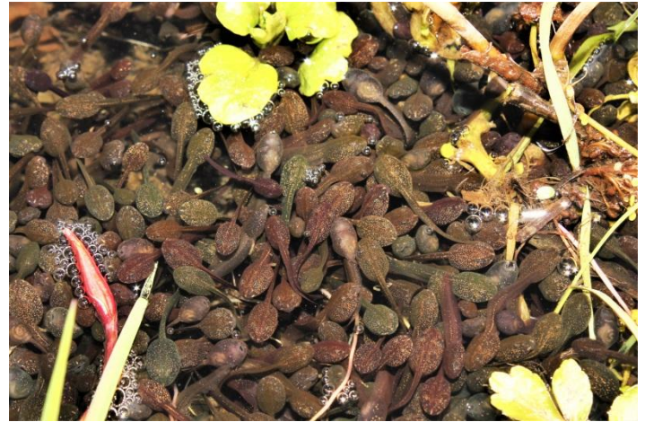
Rana temporaria tadpoles basking in sunshine 13/4/2021 West Runton, Norfolk

Jewson's old swimming pool. I brought the strange-looking creature home and put it in my outdoor Natterjack enclosure. Even partly disabled it escaped quickly, to be seen no more.