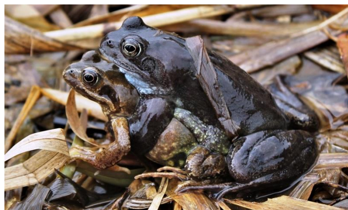
Rana temporaria in amplexus on land 12/3/2018 Beeston Common, Norfolk

But it was on 10th March 2018 that I went to Vinegar pond at night. Standing on the hillock above I looked down with my head-torch penetrating the blackness. I heard the purring of hundreds of male frogs croaking together. I saw some two thousand eyes reflecting light as if I were gazing down on the city of Las Vegas in its desert valley below. It was beyond magical; a singular experience never to be forgotten. My faith was restored in that I knew that this beautiful and wondrous species would survive Man's reign on Earth and was doing well in our cities even if not so well in the countryside.