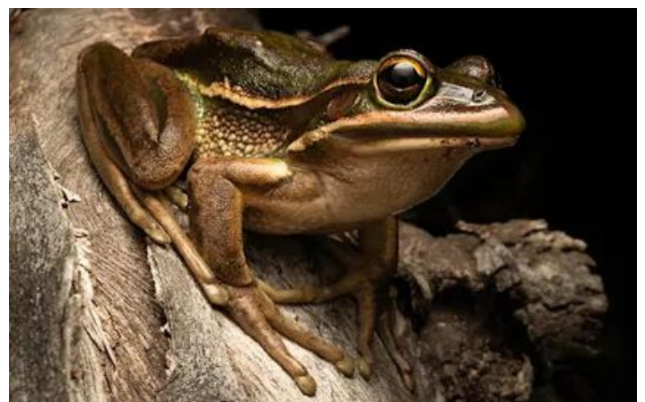
GGBFs were common around Canberra in the 1980s. Source: Ewen Lawler