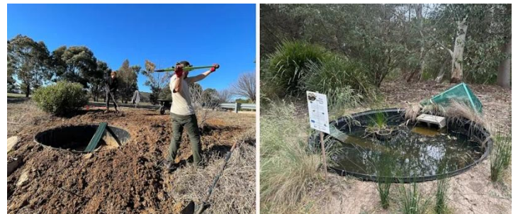
Salted satellite ponds will be dug around Canberra for the frogs to bathe in.