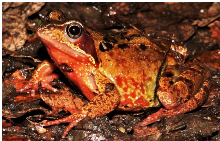
Female Rana temporaria 9/3/2018 Mousehold Heath, Norwich, Norfolk

I took my headtorch to Mousehold Heath on the first mild, damp night of Spring hoping to see frogs. My journal entries inform me that this was on 22 February 2018 and 9 March 2019. I have also noted that both the Common Frog and Common Toad require only a few minutes of light drizzle to bring them forth at this time of year if the temperature is above nine degrees. On the above occasions the frogs were everywhere and I found it fascinating how every individual was oriented towards Vinegar Pond as they emerged from holes in the ground and from under the leaf-litter. Some were already in amplexus. The migration to the breeding water had begun.