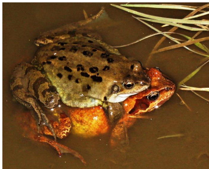
Rana temporaria in amplexus 12/3/22 Mousehold Heath, Norfolk

Mousehold Heath is a large area of woods, Gorse and Bracken that lies on the Northeast side of Norwich, surrounded by suburbs. In the middle of the heath, in a hollow, lies Vinegar Pond. During late February or early March, depending on certain circumstances, countless Common Frogs breed in the pond. I learned of this on my return from Australia and it was here that I discovered the City of Anura.