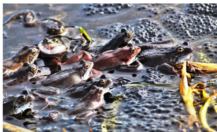
Rana temporaria males 8/3/19 Beeston Common, Main Pond, Norfolk

But it was on 10th March 2018 that I went to Vinegar pond at night. Standing on the hillock above I looked down with my head-torch penetrating the blackness. I heard the purring of hundreds of male frogs croaking together. I saw some two thousand eyes reflecting light as if I were gazing down on the city of Las Vegas in its desert valley below. It was beyond magical; a singular experience never to be forgotten. My faith was restored in that I knew that this beautiful and wondrous species would survive Man's reign on Earth and was doing well in our cities even if not so well in the countryside.