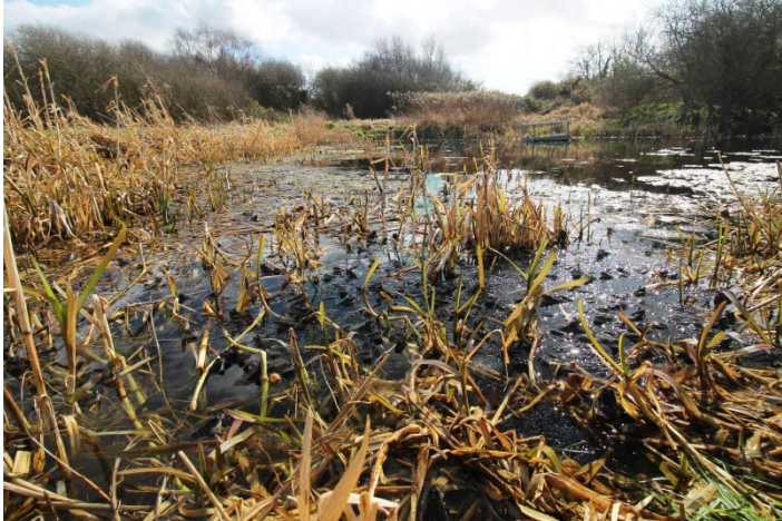
Rana temporaria 8/3/20 Beeston Common, Norfolk

your dogs to enter the homes of the newts and frogs and other such aquatic wonders. I fear that with much asperity I have given vent to my anger on folk who, when the breeding frogs and eggs are pointed out to them, still display a completely non-caring attitude; as if the World were only created for their use or enjoyment.