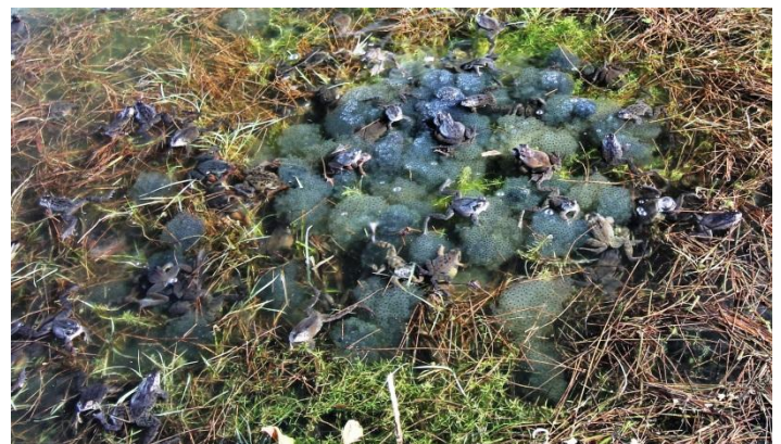
Rana temporaria 12/3/2021 West Runton, Norfolk

In my case Common Frogs were never easy to find. They are generally nocturnal and I would be lucky to ever come across one at night. On mild, wet nights, particularly during February and March, they can be seen on roads, often mashed flat by unseeing drivers of motor cars. Please keep your eyes open for them! Walking through wet meadows or along marshland dyke edges sometimes produced a frog or two. Occasionally, over the years, I would be lucky and happen upon a colony of frogs during their short breeding season. At this time they are active during the day and will expose themselves to danger during the desperate race to breed. With their blue-tinged throats inflated, the males call, push and shove and amplex with the females amongst the egg-masses; those familiar mounds containing the black dots of life within.