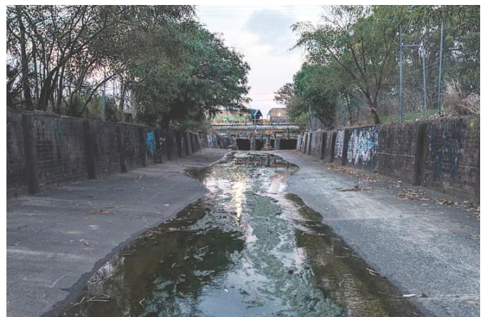
Coxs Creek, a canal that runs alongside the Greenacre frog sanctuary, is a tributary of the Cooks River.