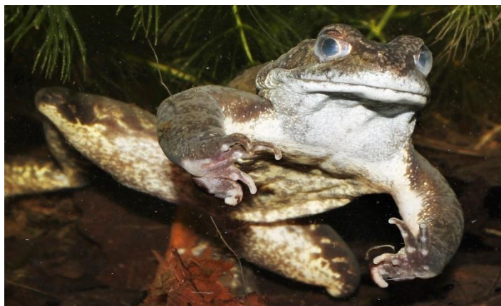
Common Frog Rana temporaria 15/4/2019 Ringland, Norfolk ABOVE swimming male showing employment of nictitating membrane underwater BELOW juvenile female underwater

Enough philosophy! Let us return to the City of Anura