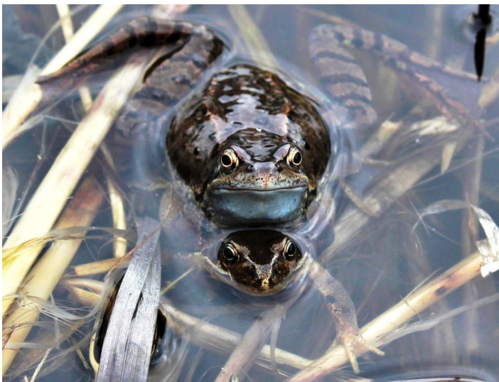
Rana temporaria in amplexus 12/3/18 Beeston Common, Norfolk

Of course, when I caught frogs to place in the amphibian pond that I had built, this was for my enjoyment. Am I a hypocrite? I believe that my interactions with other species have always been based upon a deep respect, a quest for knowledge and an insatiable interest bordering on love. I feel that this is the only way that humans should react with other species; other than leaving them and their habitats completely alone! Scientific knowledge gained through respectful study may help us understand how our species is affecting others and possibly prevent some negative outcomes of our interactions with them. With this in mind I hope that my selfish pursuit of knowledge of other species can be used in ways that benefit them. But, in the end, I have to admit that my studies and interest and interactions with other species are entirely selfish at the beginning.