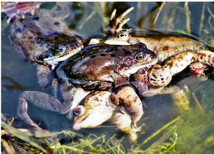
Rana temporaria frenzied males killed female Common Toad Bufo bufo 12/3/2021 West Runton, Norfolk

Cryptic colouration is a speciality of amphibians and reptiles. In order to find them you have to learn to find meaning in the shapes, textures and colours that your eye rests upon. The above poem is cryptic too, its meaning obscured, but only because I need to tell you a story in order to make sense of it.