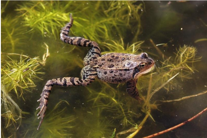
Rana temporaria male 8/3/20 West Runton Norfolk

And found the city of Anura in the darkness of the night.