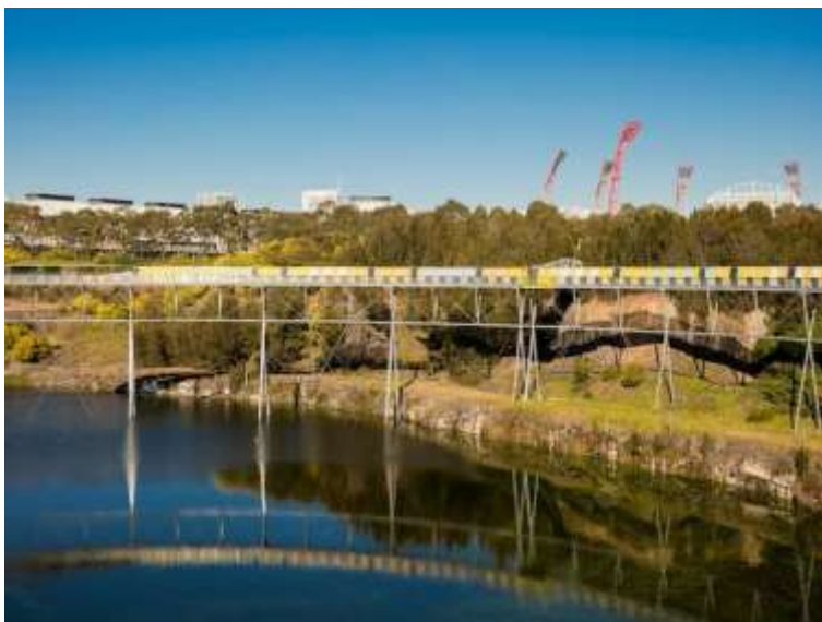
Brick Pit Ring

F ATS conducts auditory surveys around the Olympic Precinct each year, but never in the old State Brickpit, a declared area of critical habitat for the Green and Golden Bell frog. The site has been monitored by SOPA (Sydney Olympic Parklands