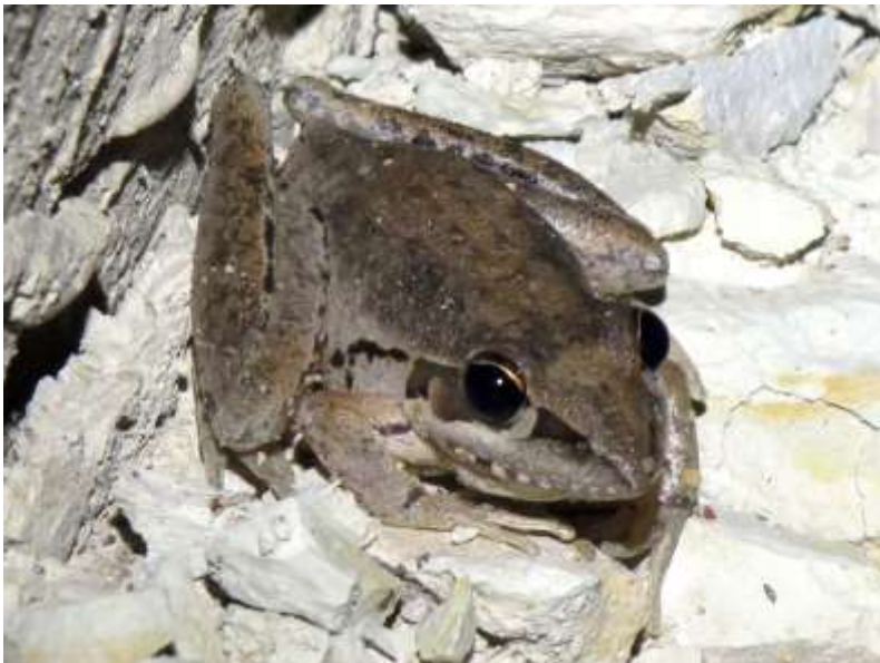
Broad Palmed Frog Sugar Creek Nov 2023

F ATS has been going to Smiths Lake since 1993. During that time we have accumulated (and reported) large numbers of animal sightings to wildlife authorities.