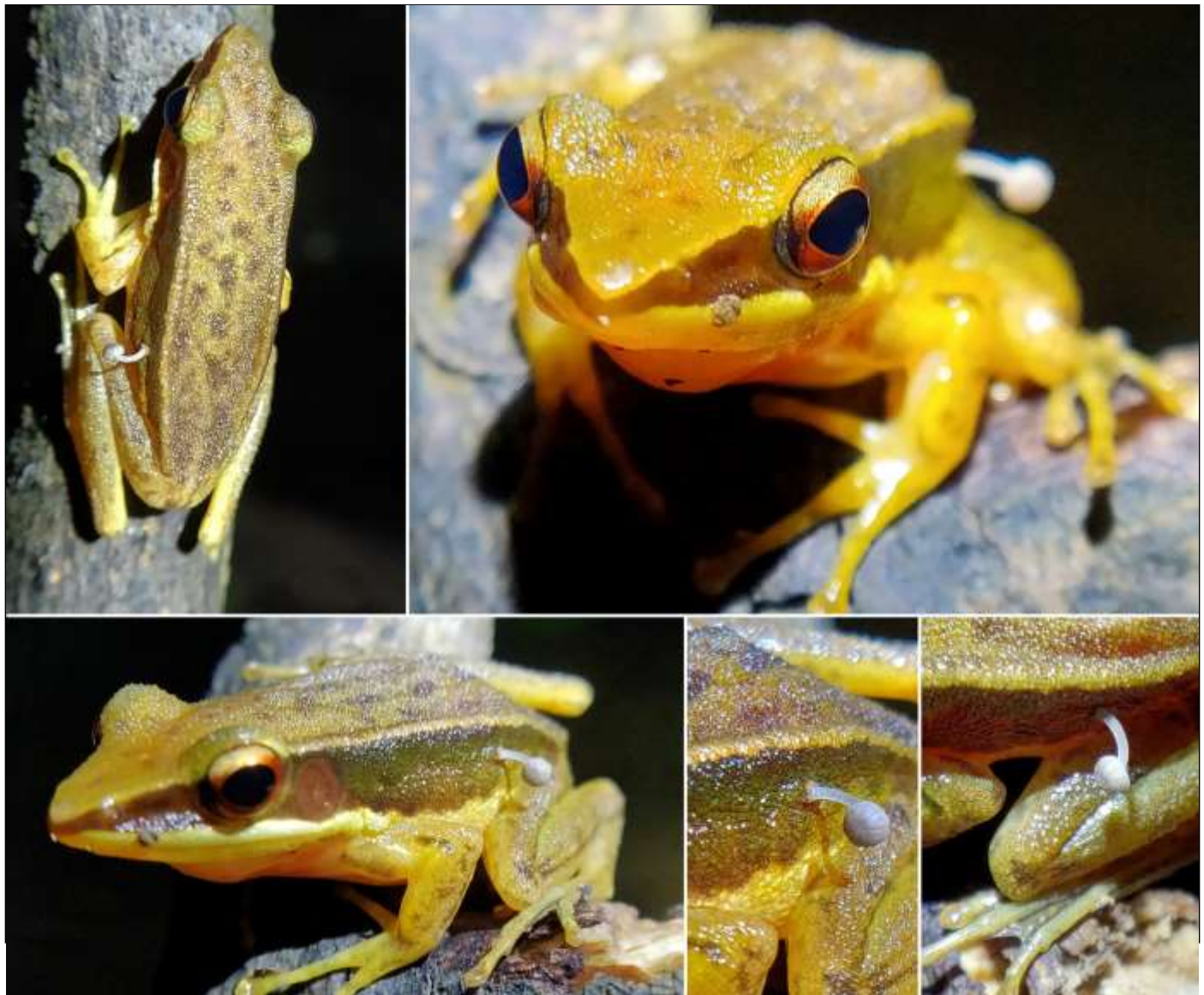
Figure 1. A Rao's Intermediate Golden-backed Frog ( Indosylvirana intermedia ) with a Bonnet Mushroom ( Mycena sp.) sprouting from its left flank found on 19 June 2023, at Mala, Karkala, Karnataka, India.

At 1230 h on 19 June 2023, at Mala, Karkala, Karnataka, India (13.380833 N, 75.226667 E), in the foothills of the Kudremukha Ranges, we encountered about 40 Rao's Intermediate Golden-backed Frogs in a small roadside rain-