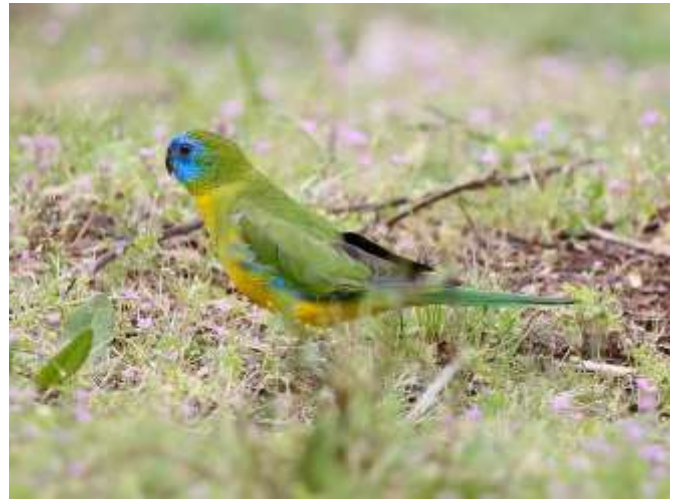
Male Turquoise Parrot

conditions were great for most animals. As a result, everybody saw new species and had a great time.