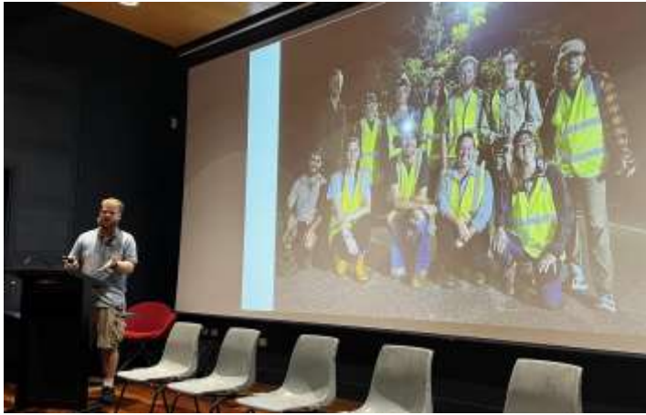
See last month's FrogCall #189 and future updates.