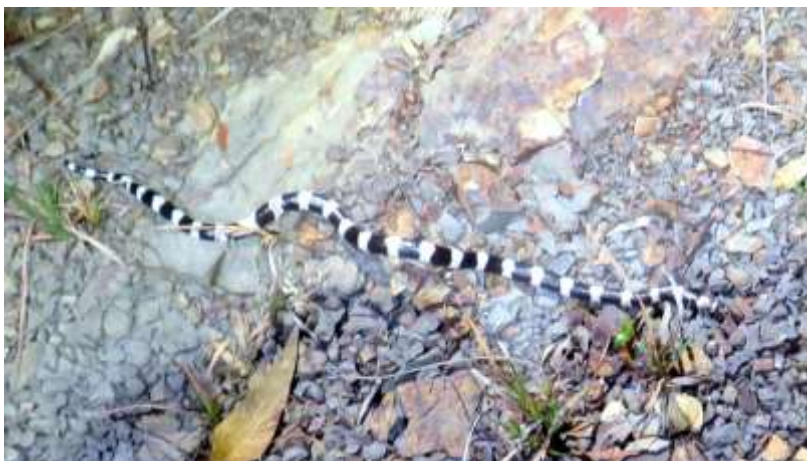
Bandy Bandy Snake Sandbar Quarry Nov 2023

At Smiths Lake, we visit some sites regularly, while we also have a large number of sites that we only visit opportunistically.