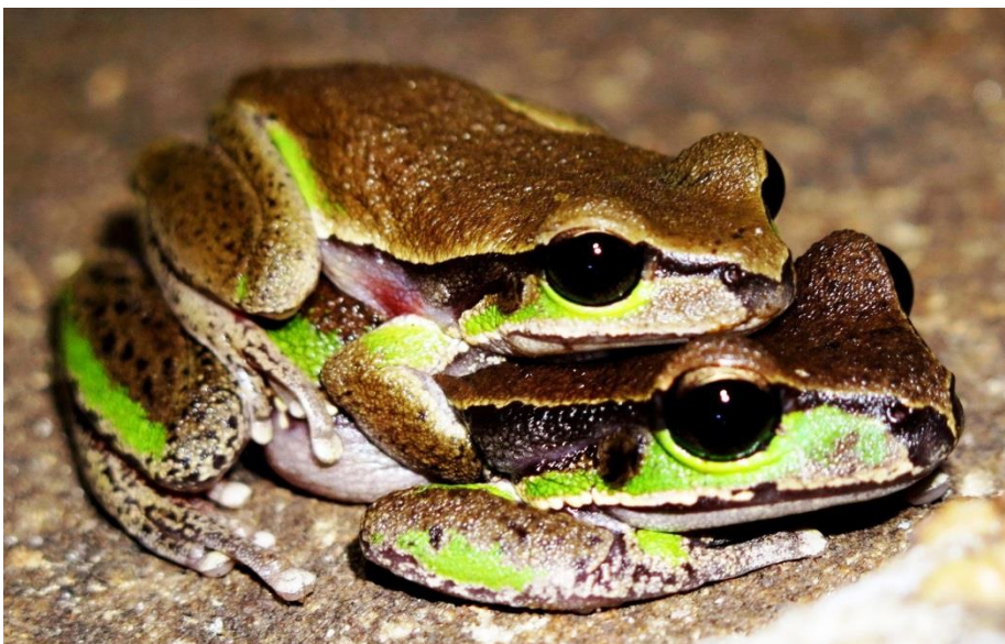
Image by Michelle Toms Litoria citropa Blue Mountains Tree Frogs FATS Frog-O-Graphic competition 2017 Darkes Forest

You are invited to our FATS meeting. It's free. Everyone is welcome.