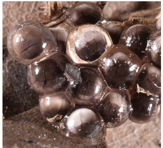
Geocrinia laevis eggs laid on land.