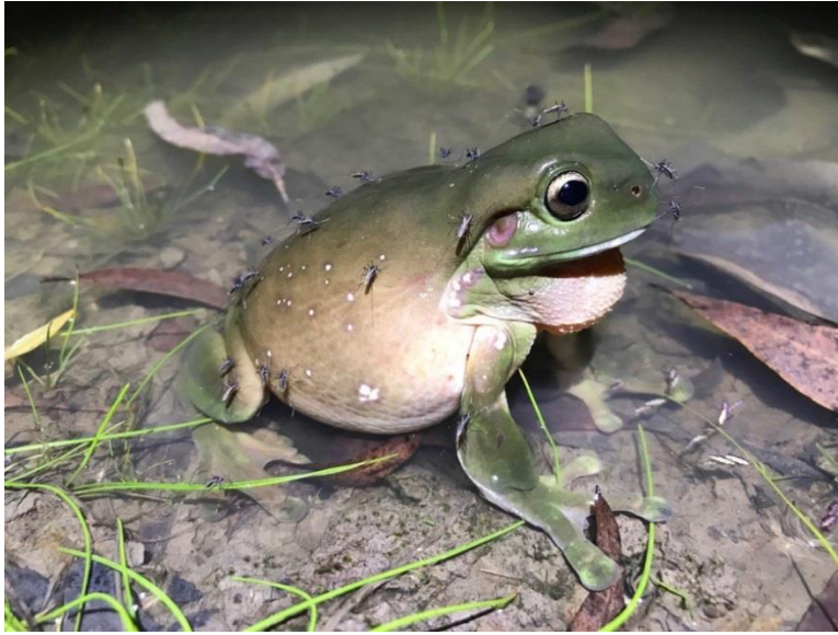
A Green Tree Frog Litoria caerulea being attacked by mosquitos.

C heck your frog photos for frog-biting flies and submit them to our study