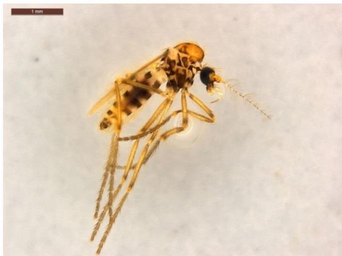
A frog-biting midge Corethrella sp. with visible frog blood meal.

Understanding how species are distributed is important for informing biodiversity conservation, but for some species, it can be the biggest hurdle. Species that are rare or cryptic can be easily missed by searching biologists. Recently, I attempted to increase the detectability of frog species by enlisting the help of frog-biting flies – tiny, bloodsucking parasites that follow the sound of frogs' calls. I played frog calls to attract flies, sequenced the DNA in their blood meals (coined invertebrate-derived DNA, or iDNA), and forensically established that threatened frogs were in the area through the DNA sequences more effectively than when searching for frogs directly.