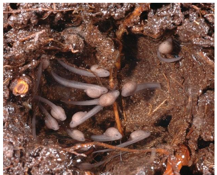
Newly hatched Anstisia rosea tadpoles