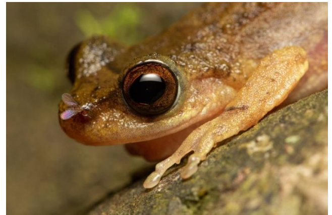
Moth fly Sycorax sp. 'sampling' DNA from a common mist frog Litoria rheocola , an endangered species.

If you've photographed frogs in Australia and are over 18, I'd love for you to closely examine your pictures, looking for any frogs that have flies, midges, or mosquitos sitting on them. If you find flies, midges or mosquitos in direct