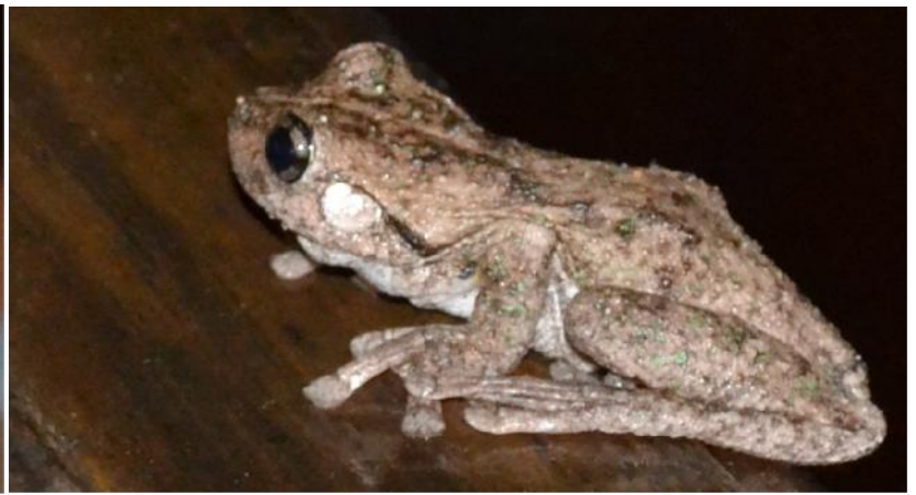
Helen's "wild" Perons Tree Frogs Litoria peronii at Strathfield are quite big especially when found in the house!