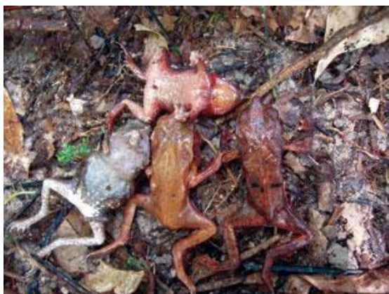
MATING MELEE: The bodies of dead female frogs (bottom) litter the forest floor after a mass-breeding event.