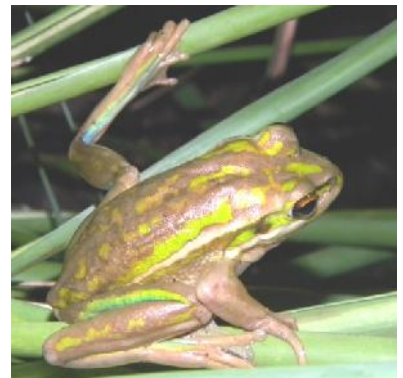
Litoria aurea Green and Golden Bell Frog above and below