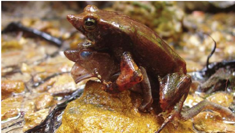
DEAD STILL: A male Rhinella proboscidea frog (top) attempts to squeeze mature oocytes from a dead female.

D uring frogs' hectic mass breedings, females often die. But one species appears to have found a work-around: males harvest and fertilize their partners' eggs after her death.