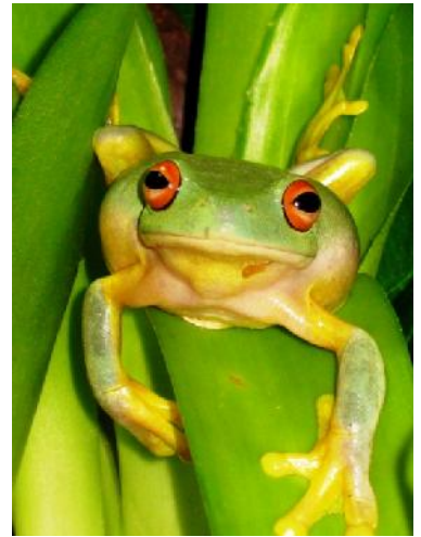
Litoria chloris Red-eyed Tree Frog