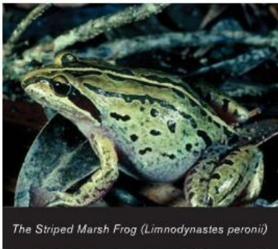
The Striped Marsh Frog ( Limnodynastes peronii )

The Seahorse edition 1 2013 p29 www.newcastle.edu.au forwarded for Frogcall by Wendy & Phillip Grimm