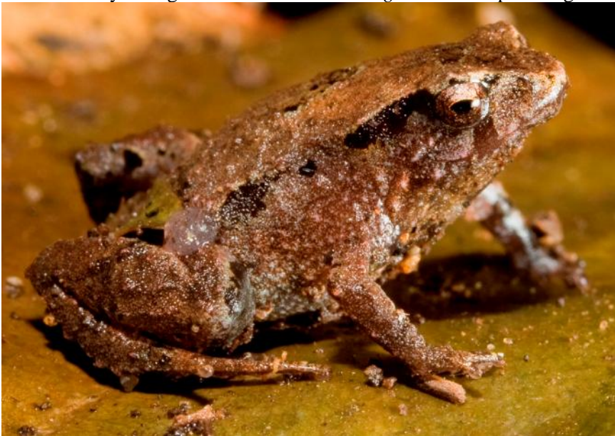
Assa darlingtoni - Marsupial Frog