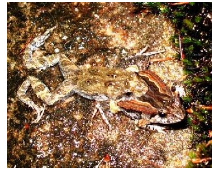
Crinia signifera in amplexus

Many of the most impressive FATS talks are now given by members who are armed only with a sense of adventure and a cheap camera!