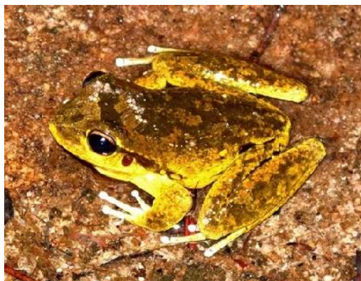
Male Litoria lesueuri