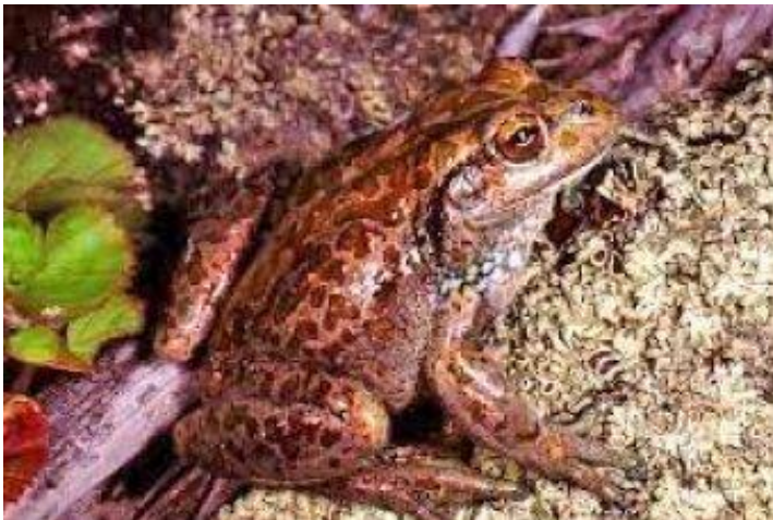
Spotted-thighed frog hops into SA