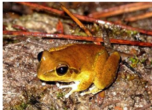
Male Litoria lesueuri