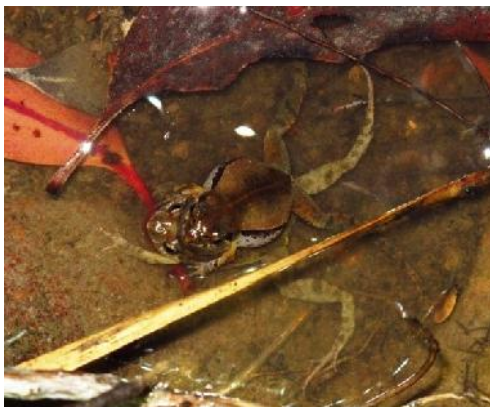
Paracrinia haswelli in amplexus