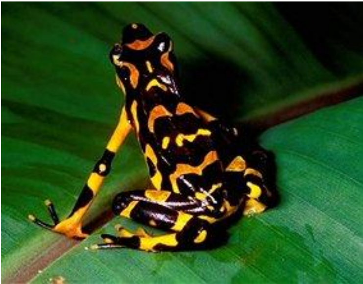
Just one of many Costa Rican frogs whose numbers have been decimated by the chytrid fungus