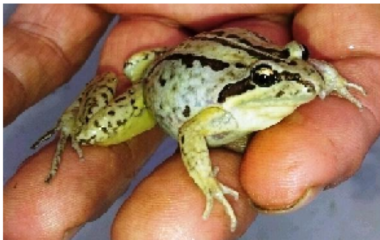
Striped Marsh Frog Limnodynastes peronii from Thornton near Newcastle. Probably coloured green by sitting in algae.