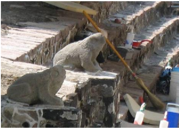
Surviving section of stairway showing frog iconography. Frog Altar, Tenochtitlan. (under excavation and restoration).