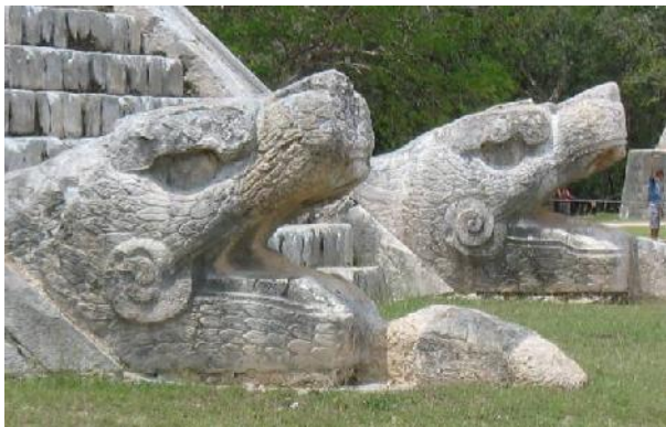
Serpent heads, El Castillo, Chichen Itza.

T he great archaeological ruins of Mexico are richly decorated with many ornate carvings of frogs and snakes. Both were powerful symbols of religious and cultural ritual. For the great city-building societies of ancient Mexico (i.e. the Olmec, Aztec, Mayan, Toltec and the unknown builders of the great city of Teotihuacan), this highly elaborate form of frog and serpent worship became a notable, recurring theme. More remarkably, these ritual symbols seemingly arose independently many times, often many centuries apart. This repetition of thought was often spread across widely dispersed, quite insular, and often quite disparate empires.