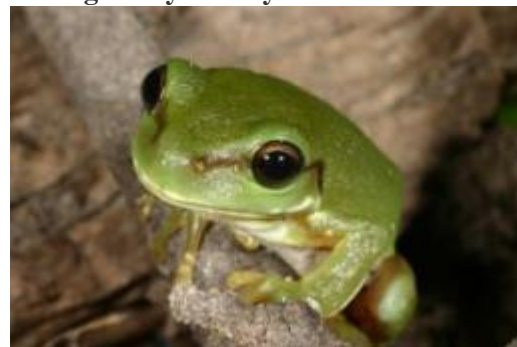
Urban frogs squeezed out Harry Hines courtesy of QPWS

W orld-wide, frog species are in decline, a signal of ecosystems under stress. So how can we preserve frog species in our cities? As housing developments swallow up the green space on the urban fringe, are backyard ponds a lifeline for threatened frogs? Forwarded to Frogcall by Wendy Grimm