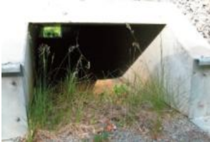
Newer roads have underpasses.