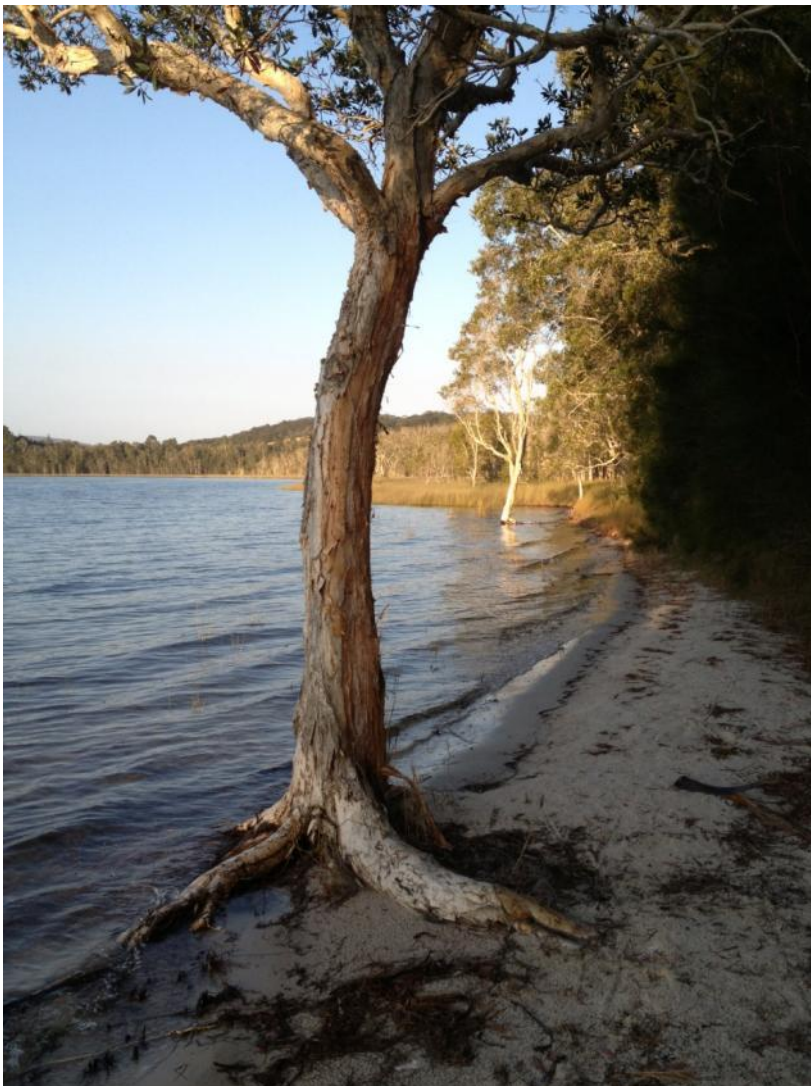
Regular field trip site, Smiths Lake NSW

https://www.facebook.com/groups/FATSNSW/