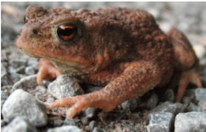
The most common toad Bufo bufo Erdkröte

Below is a photo of the long fences that stop toads wandering from the forest onto roadways. Volunteers collect the toads that have come to cross the road. The toads are stopped by the fences that they are unable to climb over. They are placed in buckets and taken by volunteers safely to the summer breeding ponds on the other side of the road. Six months later, at the beginning of May, the fences are moved to the other side of the road and volunteers again collect the toads in buckets and take them back to the forest side of the road. Thank you for such an entertaining, insightful and informative presentation Rainer.