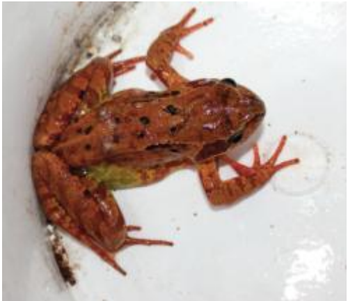
Rana temporaria Grasfrosch

Below is a photo of the long fences that stop toads wandering from the forest onto roadways. Volunteers collect the toads that have come to cross the road. The toads are stopped by the fences that they are unable to climb over. They are placed in buckets and taken by volunteers safely to the summer breeding ponds on the other side of the road. Six months later, at the beginning of May, the fences are moved to the other side of the road and volunteers again collect the toads in buckets and take them back to the forest side of the road. Thank you for such an entertaining, insightful and informative presentation Rainer.