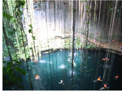
Cenote - popular tourist attractions today, but once a place of worship and sacrifice. Ik Kil Cenote, Yucatan Peninsula.

Often, the only source of permanent water within this limestone region is the cenote, a large opening which forms when the roof of a cave collapses to reveal, often quite spectacularly, an underground source of water.