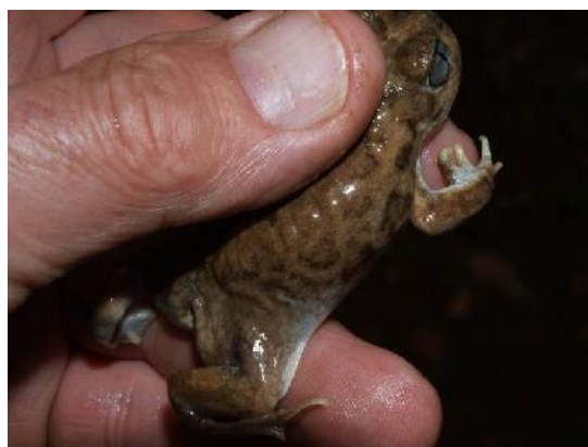
Neobatrachus groin webbing