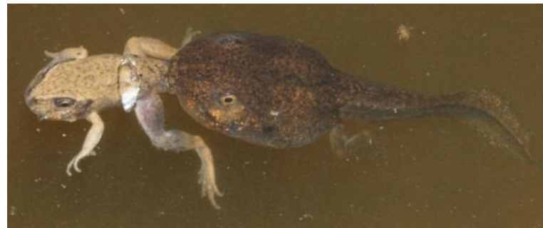
Cyclorana maini tadpole eating metamorph Pseudophryne robinsoni

frogs were now legally acknowledged as animals in New South Wales and that the conservation status of many species needed to be resolved. Various members of FATS made submissions to the State Government regarding the apparent abundance of certain frog species- the combined input from the frogging community formed the basis for the initial determination of the threatened and endangered frogs in this state. Arthur White (extract from Frogcall 116)