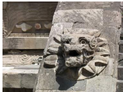
Façade detail, La Ciudadela

Serpents were associated with swampy areas. For the ancient Mexico, many gods dwelled in the underworld, and snakes were seen to have a menacing association with the ground. Snakes became particularly feared and powerful symbols. The snake was truly a dichotomous character, at one and the same time it represented life, greenness and peace (alluding to their association with life-giving watery and swampy environments), it also represented heat, the desert and war (snakes also had an association with arid regions). The most important deity of ancient Mexico is undoubtedly the "Feathered Serpent".