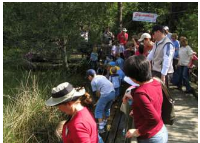
Ku-ring-gai Wildflower Gardens – dip netting

No experience is necessary, nor are any of our trips arduous. All you need is a torch/headlamp, and shoes that can get wet. It is a wonderful and safe way to experience our frogs in the wild, learn about them and enjoy a balmy evening outdoors. Look for our field-trips announcements in this issue. Members need to book first, and remember to confirm in the final days whether the trip is going ahead (sometimes we cancel fieldtrips if there are bushfires, swollen creeks etc). SO ALWAYS CHECK BEFORE DRIVING TO A SITE!!