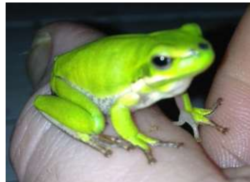
"Kermit" Litoria fallax rescue