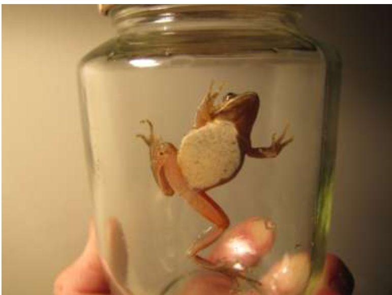
Blaxland garden - Litoria verreauxii. Whistling tree frog