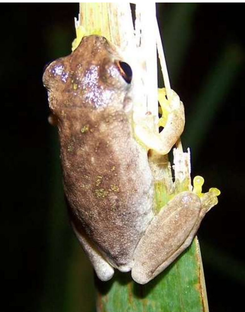
Litoria tyleri Tyler's Tree Frog