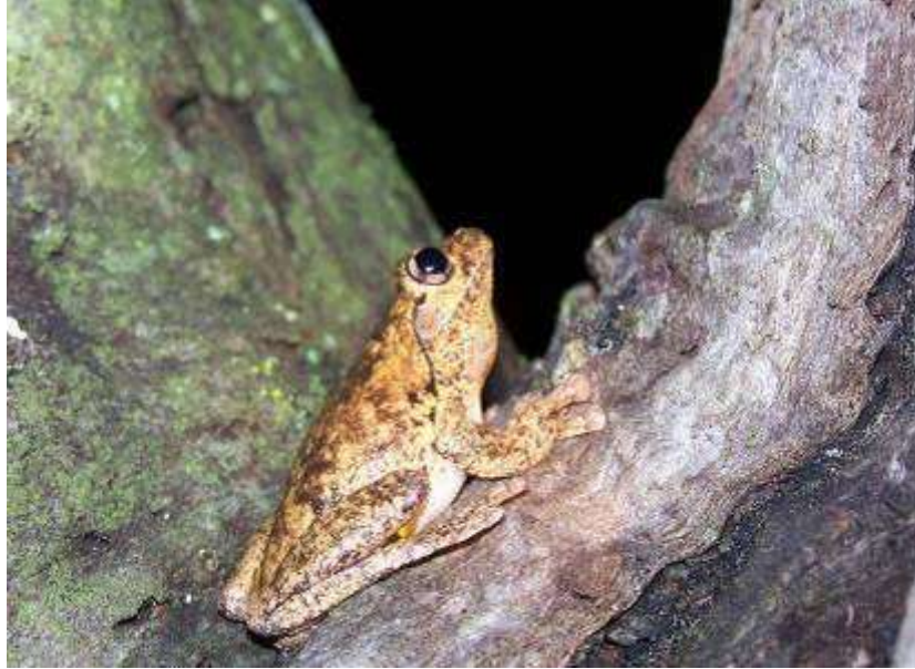
Litoria peronii Perons Tree Frog

INSURANCE DISCLAIMER FATS has public liability insurance for its various public functions. This insurance does not cover FATS members; it covers the public and indemnifies FATS. We are currently checking with insurance firms to see whether a realistic group policy can be organised to cover FATS volunteers and people who attend field trips.