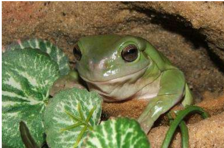
Green Tree Frog Litoria caerulea