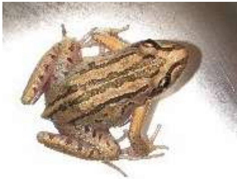
Striped Marsh Frog Limnodynastes peroni sneaks into Lindsay's Cremorne bedroom