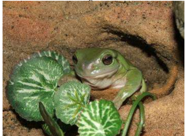
Photo by Vicki Deluca who was the mystery (unknown) photographer in Frogcall 117