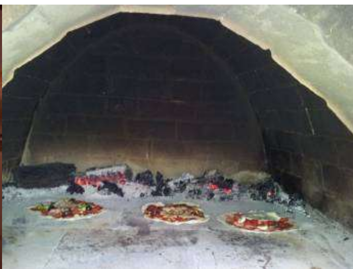
Great pizzas and great company.

Too wet for catching fish and frogs. A good time was had by all. L.V.