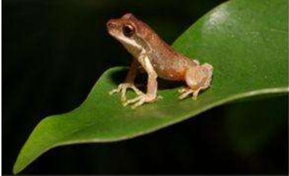
Whirring Tree Frog ( Litoria revelata )