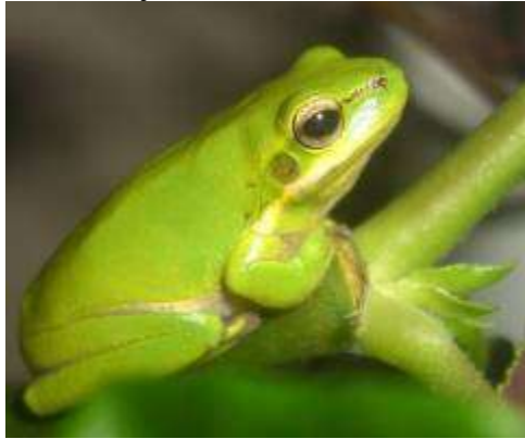
Litoria fallax

With mealworms you also have to keep the ants out, and moisture, and if you're allergic to them, also your face and your fingers. Because some people can be allergic to them in a big way – as this one well knows.