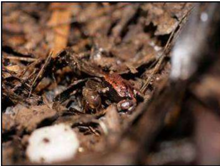
Red-Backed Toadlet Pseudophryne coriacea Above and two photos below