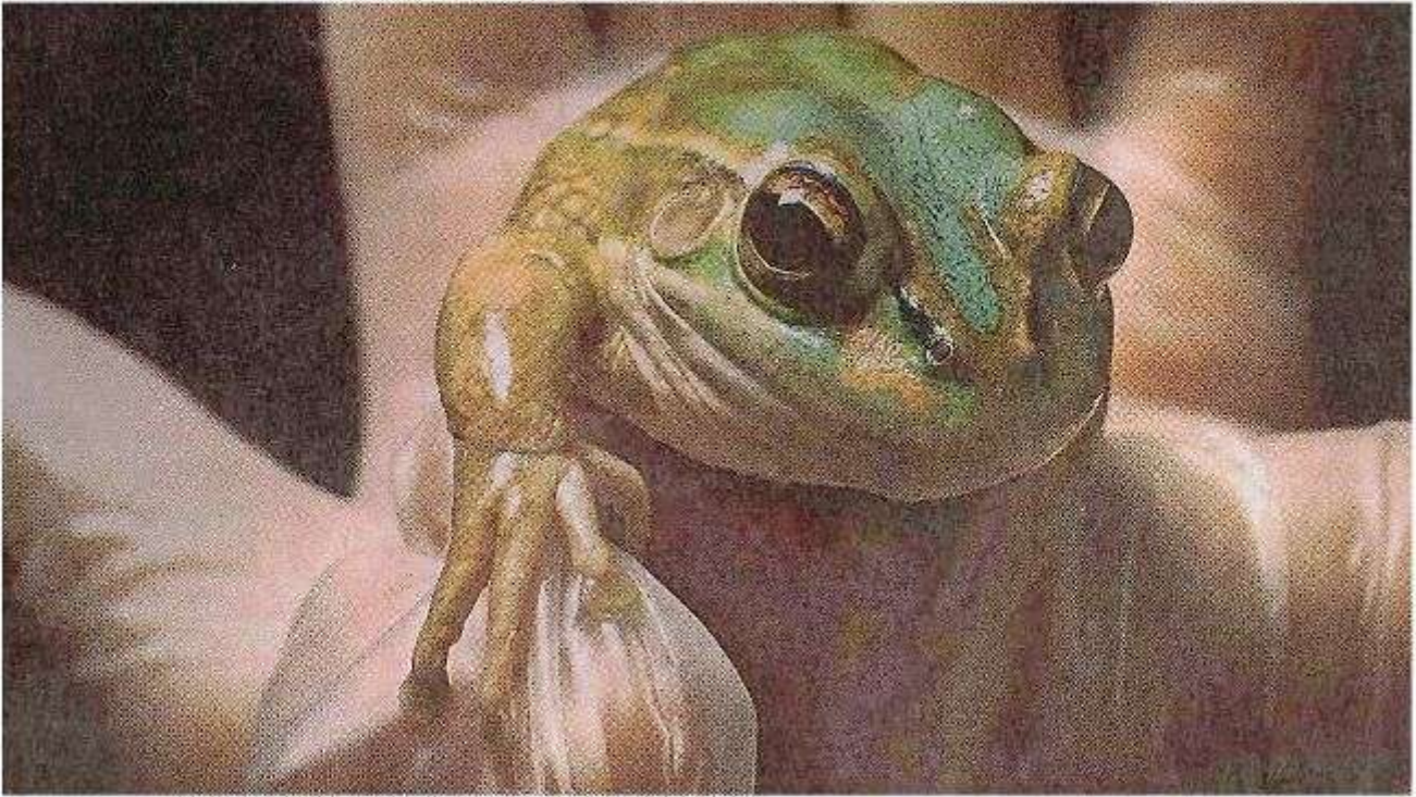
A living germ killer ... a green and golden bell frog at Taronga Zoo. It belongs to a species which secretes chemicals that can kill bacterial strains resistant to antibiotic drugs.