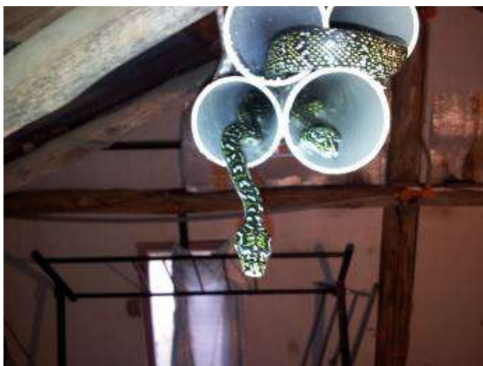
Barn with released snakes and ladders.