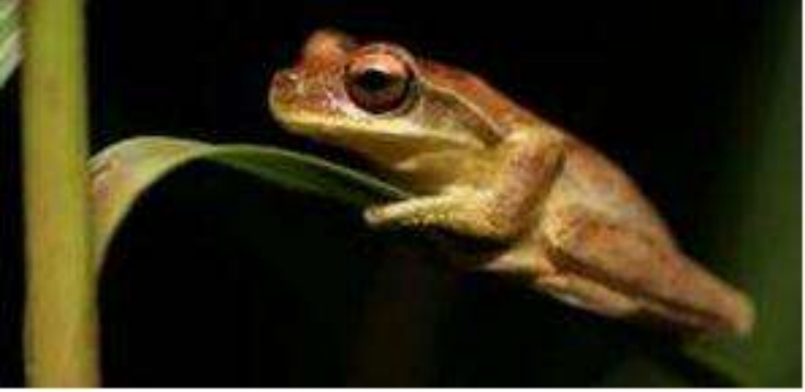
Whirring Tree Frog ( Litoria revelata )