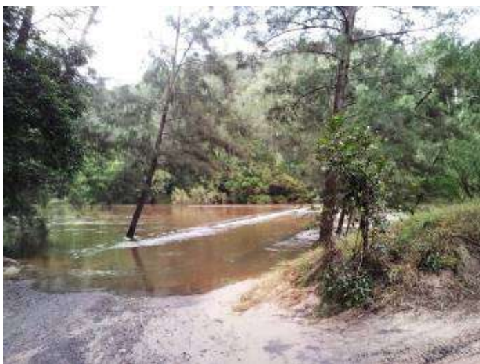
Joint field trip on 12.2. 2012 to my place Upper Colo. Bridge gone under.