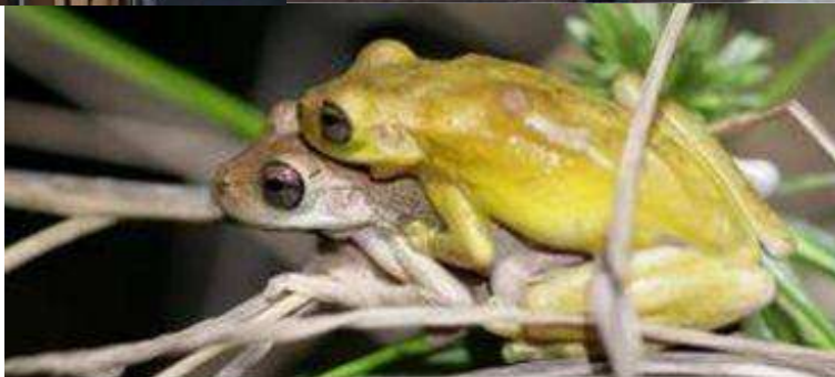
Tyler's Tree Frog ( Litoria tyleri )