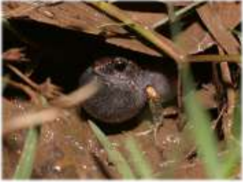
Dusky Toadlet Uperolia fusca