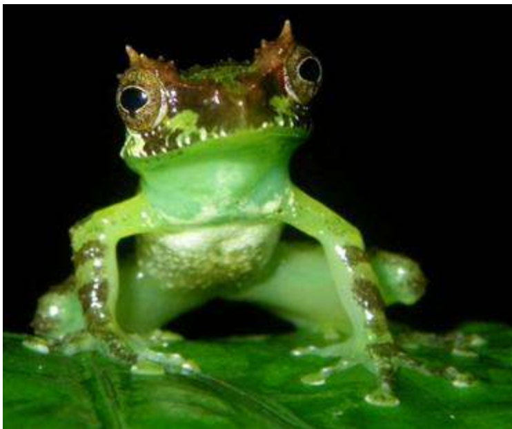
Gracixalus supercornutus

*** NO FATS MEETING *** *** ON 6/4, "GOOD FRIDAY" ***