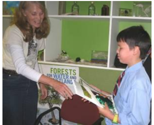
FATS 20 YEAR ANIVERSARY AND FROG-O-GRAPHIC COMPETION CELEBRATIONS DECEMBER 2011

http://bolivianthoughts.com/2011/11/29/tipnis-humor/