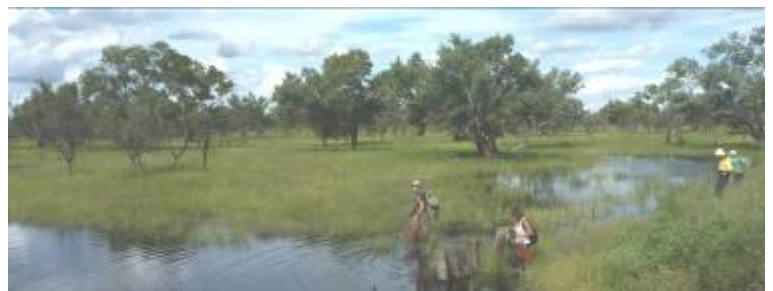
Long Plain Cowal near the height of the flood, finding tadpoles and vegetation information.

Dubbo. There are open lagoons, large reedbeds, river red gum woodlands, and meadows of couch grass and aquatic vegetation. It's a fabulous place to do frog research. I've also been rather lucky to have started my research at the end of a decade long drought as during the summer of 2010-11, the Macquarie Marshes experience the biggest flood since 2000!