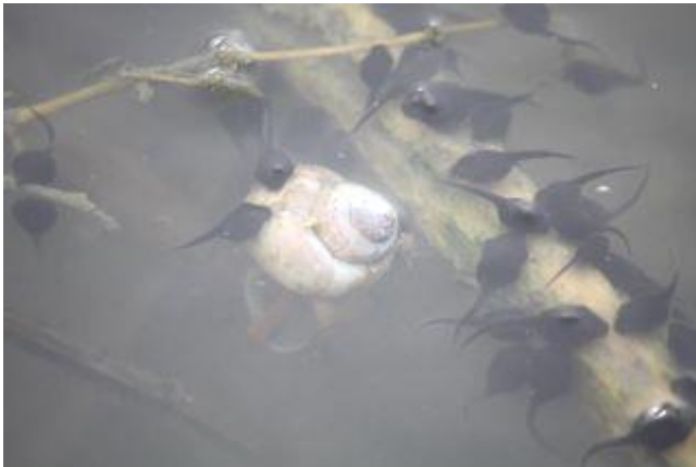
Cane Toad tadpoles

Although a few Australian frog species, such as the green tree frog, are flourishing in human environments, many species have suffered dramatic population declines since the 1980s. Fifteen species of Australia's frogs are currently endangered, twelve are listed as vulnerable and four have become extinct. Of particular concern is the disappearance of frogs from pristine habitats.