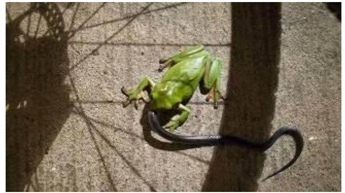
Green Tree Frog tries to eat a red bellied black snake in Queensland.

http://www.bbc.co.uk/news/science-environment-15060980 forwarded to FATS by Andrew Nelson 26 9 2011 article by Richard Black Environment correspondent, BBC News