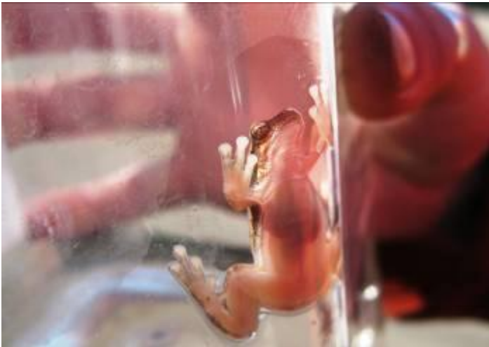
One of the many Litoria rubellas rescued at Auburn Bearing Engineering, Schaeffler Australia