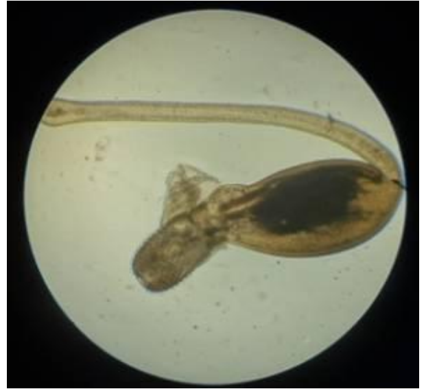
Acanthocephalan found in the body cavity of a frog

Frogs, like all animals, can be susceptible to injuries, infections, parasites and other diseases and many of these problems can be treated if detected early.