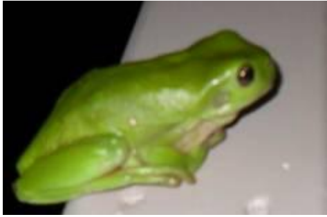
Carly's Green Tree Frog at Paterson NSW

T he Spring and Summer FIELD TRIPS program has concluded. FATS will commence trips again after the Autumn Winter recess.