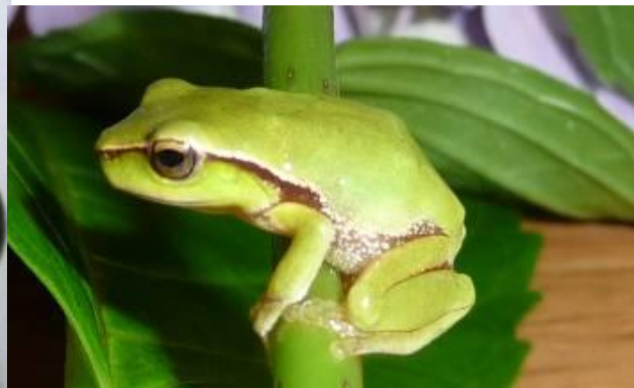
Litoria phyllochroa at Thornleigh

F ollowing the success of the 2011 Castle Hill Reptile Expo we would like to invite you to attend the 2012 Castle Hill Reptile Expo at Castle Hill. 11-12 Feb '12 www.reptiles.com.au - see our facebook page under expos