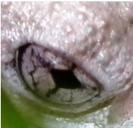
Litoria peronii

We live in Western Sydney, just outside of Blacktown and have a few local Green Tree Frogs and Marsh Frogs. http://frogs.org.au/frogs/species/Litoria/peroni/ and www.frogsaustralia.net.au/frogs/