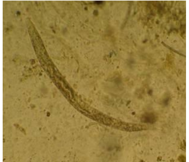
An unknown worm larva found in a faecal sample of a frog