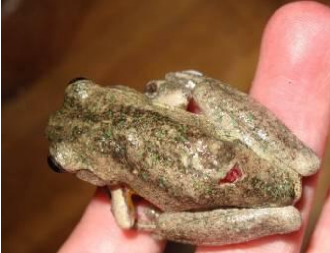
RESCUED BY MICHELLE TOMS Day 1 back injury