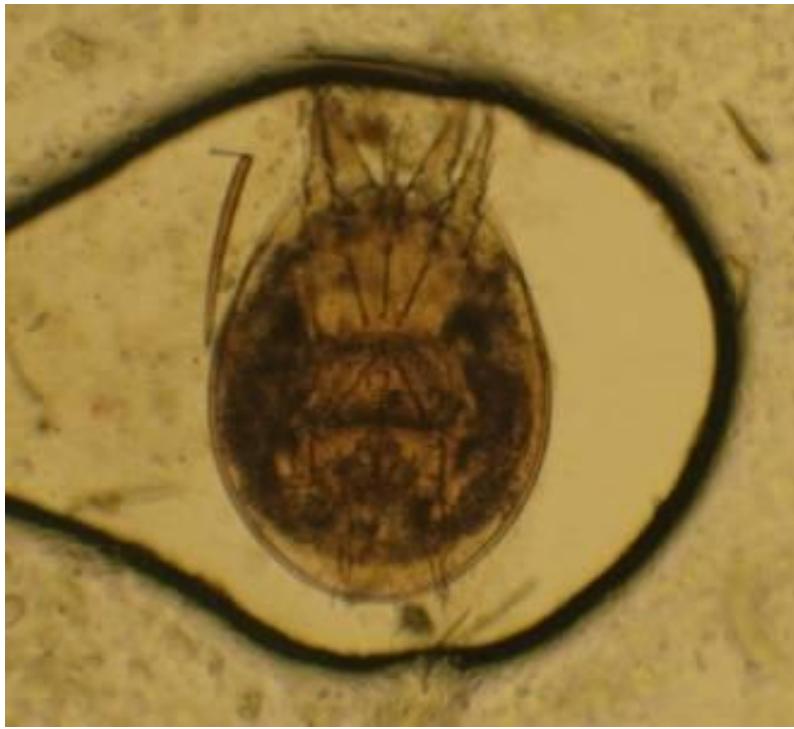
An unidentified mite nymph found in the faeces of a frog

Vets at the Bird and Exotics Veterinarian clinic consult with and treat many non-traditional and non-domesticated animals. This clinic caters for the diagnosis and treatment of birds, reptiles, fish, and small mammals excluding dogs and cats, as well as amphibians including frogs.