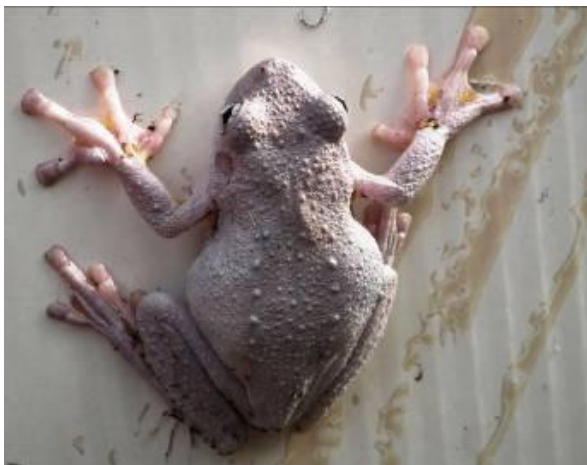
Perons Tree Frog