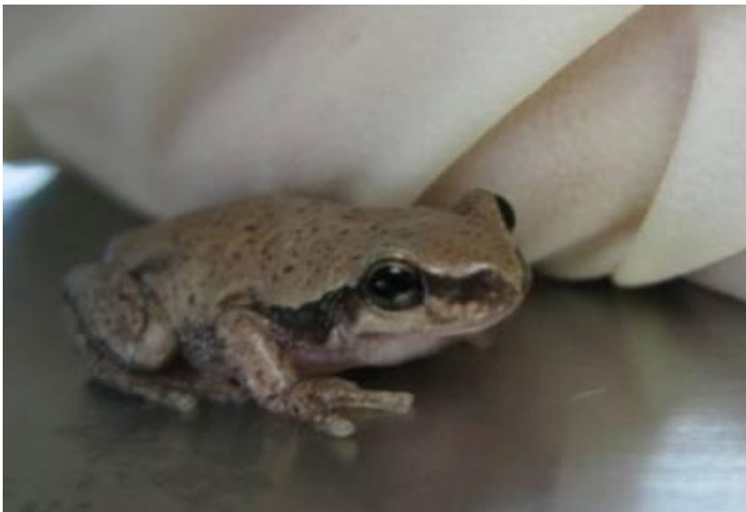
Litoria rubella getting a health check at the vet clinic

The clinic itself is designed specifically with appropriate hospital enclosures (ranging from open cages/hutches for birds and mammals to heated reptile/amphibian enclosures and tanks) as well as size- and species- appropriate surgical and diagnostic equipment. Ultrasound and radiographic imagery for tiny animals, blood tests, parasite identification, surgeries and biopsies are some of the more common procedures carried out on site at this clinic.