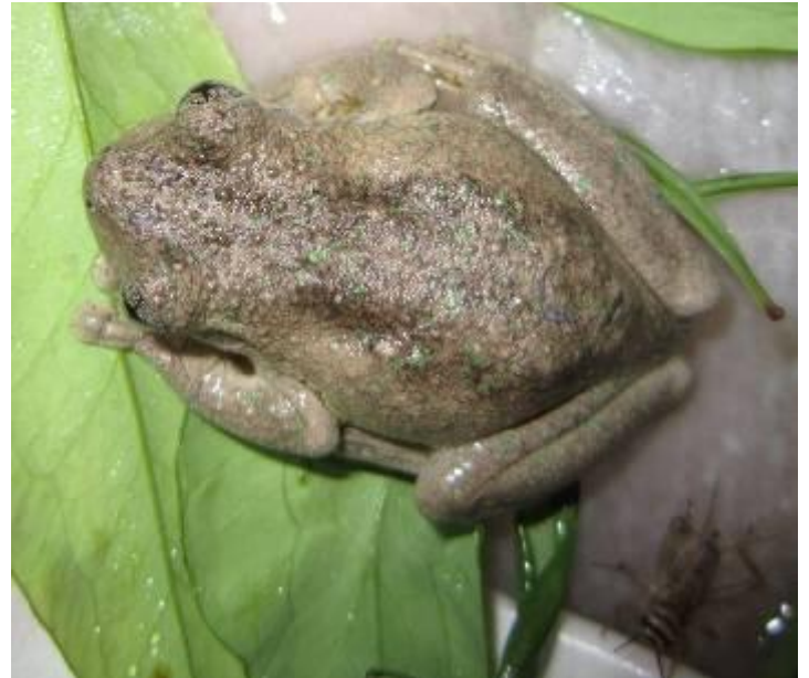
Day 16 Local Perons frog ready for return to wild