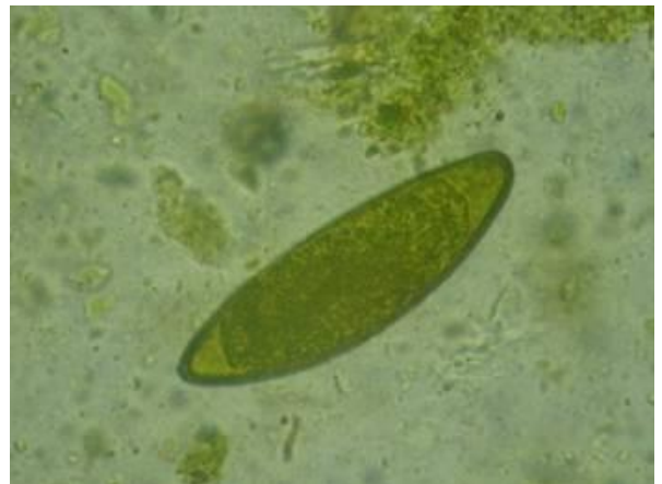
A pinworm egg found in the faeces of a frog