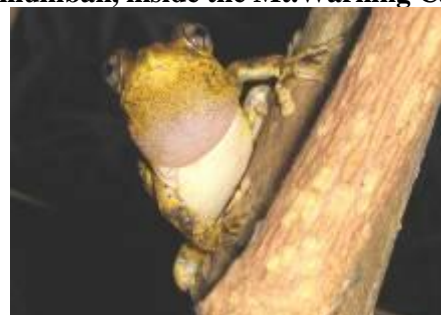
Litoria tyleri Laughing Tree Frog or Litoria peronii ? frog calls help distinguish similar species http://frogsaustralia.net.au