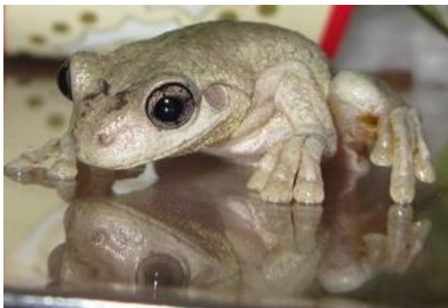
Day 8 on the mend Well done Michelle!