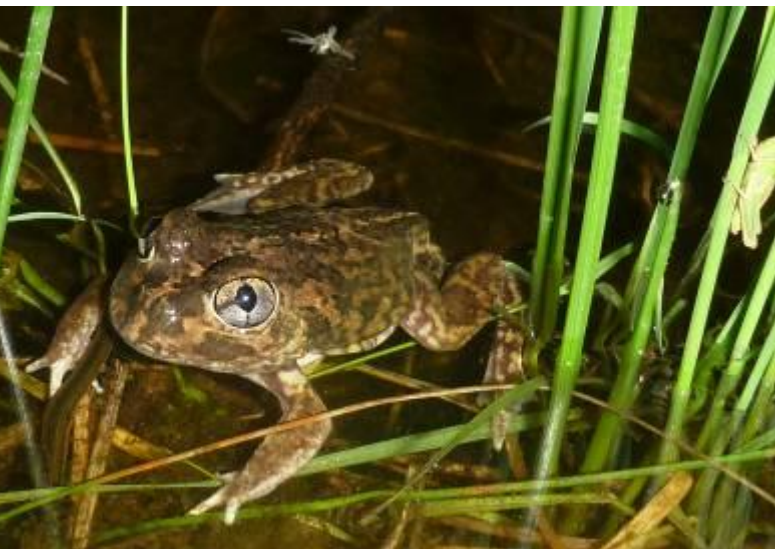
Neobatrachus sudelli

My research has enjoyed great support from the local community. I also couldn't do it without my many volunteers from Australia and overseas. I also wouldn't have been able to complete my fieldwork without the two student research grants from FATS, this support was very much appreciated – thanks FATS! Jo Ocock