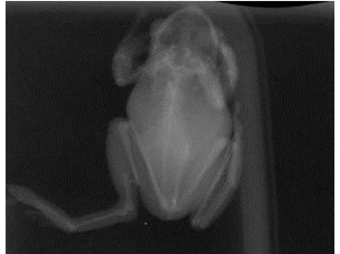
A Radiograph of L. peronii with a fractured leg

All of the vets at this clinic are passionate about all of their patients and uphold the ideal that all animals deserve high quality veterinary attention regardless of species. In order to provide a high quality service the vets here combine general veterinary medical knowledge with current scientific data for different species collated from many sources. Like all scientific fields it is ever changing and the team of vets at this clinic are