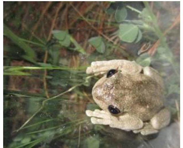
Day 16 release day - original habitat known