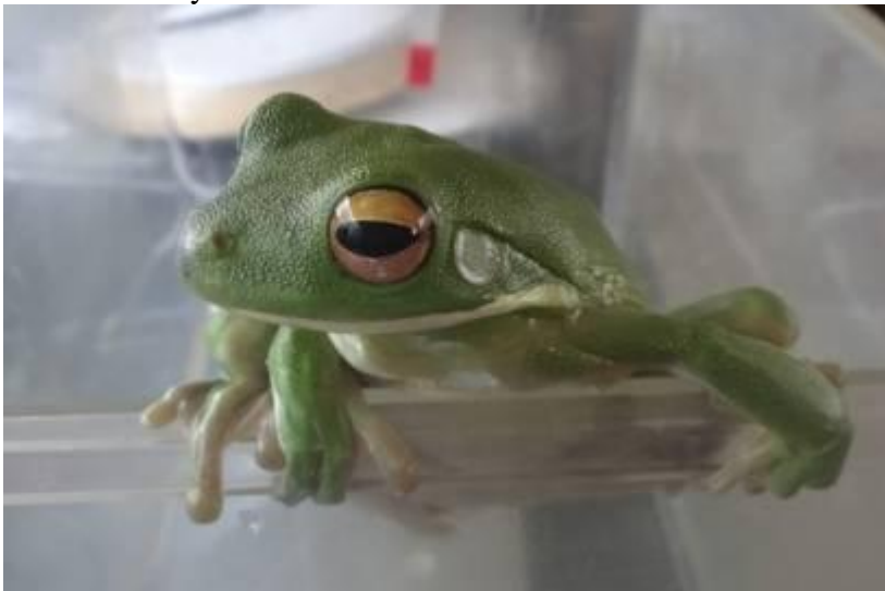
Litoria infrafrenata White-lipped Tree Frog awaiting adoption.

Pictured at the Bird & Exotics Vets, for a health check