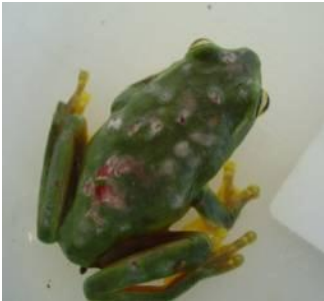
This L. gracilenta was infected with Tetrahymena . His skin improved with treatment.

A veterinarian is the logical answer for most animals but is not always the first person a frog owner goes to for advice regarding their sick frogs. Perhaps it is thought that vets are either not interested or simply do not know much about frogs. In some cases it is assumed by the owner that frog diseases cannot be treated. These days there are many vets able to treat frogs. Although ‘Frog Medicine’ is not a part of the average veterinary training there are vets who are interested and have taken steps to improve their knowledge and experience with these animals. Almost all vets and vet clinics that claim to have an interest in ‘Exotic’ pets are very willing to try and diagnose and treat frogs.