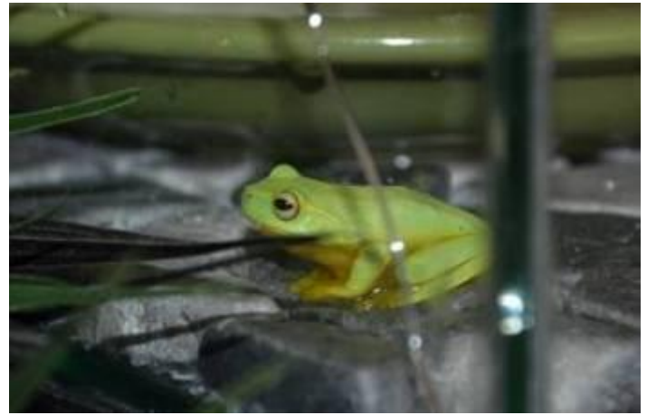
This L. gracilentia is in long term care to find out more about a particular parasite it is carrying

dedicated to constantly renewing and updating their knowledge and skill base.