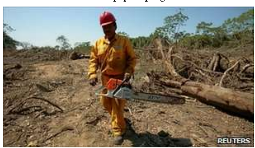
The road is already under construction . Plans for a road through Tipnis have divided opinion in Bolivia.

Mon, 26/9 Bolivia's Defense Minister Cecilia Chacon resigned after police violently broke up Sunday a protest by indigenous and environmentalists groups who were marching towards La Paz, against the construction of a government planned highway that would cut through the nature preserve Territorio Indigena Parque Nacional Isiboro Secure, TIPNIS, home to 15,000 natives. http://www.chron.com/news/article/Bolivian-official-quits-in-march-backlash-2190184.php#loopBegin