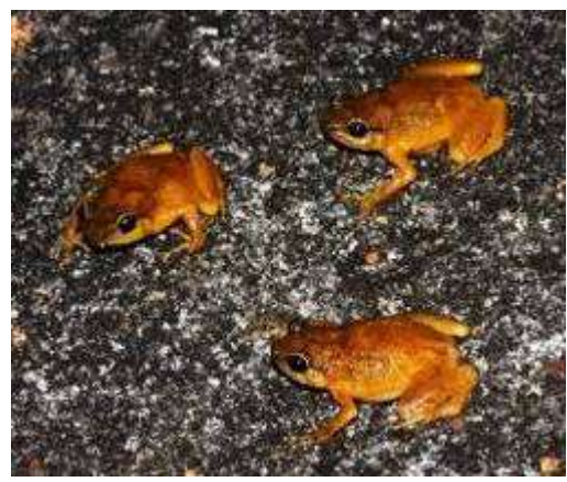
Black Mountain Frog harem Cophixialus saxatilis

http://www.youtube.com/watch?v=tfyXOpq1YjA