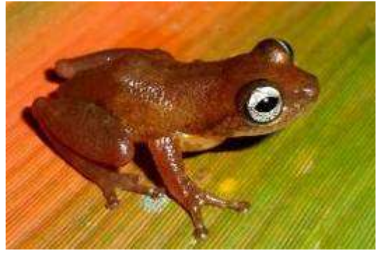
Raorchestes uthamani lives in reeds. Photo D.P. Kinesh 9 8 2011 http://www.greatnewsnetwork.org/index.php/news/article/10_ne w_frogs_discovered_in_indias_great_rainforest/ sent to FATS Facebook page by Barb Tyler

Nine of the new species belong to the genus Raorchestes, a genus only found in the Western Ghats, which now includes 39 total species. The tenth species belongs to the Polypedates genus, which was discovered near tea plantations. One of the new Raorchestes frogs Raorchestes manohari was described in the paper in particularly effusive terms: "This is one of the most beautiful species with no resemblance to any of the described species of Raorchestes genus.