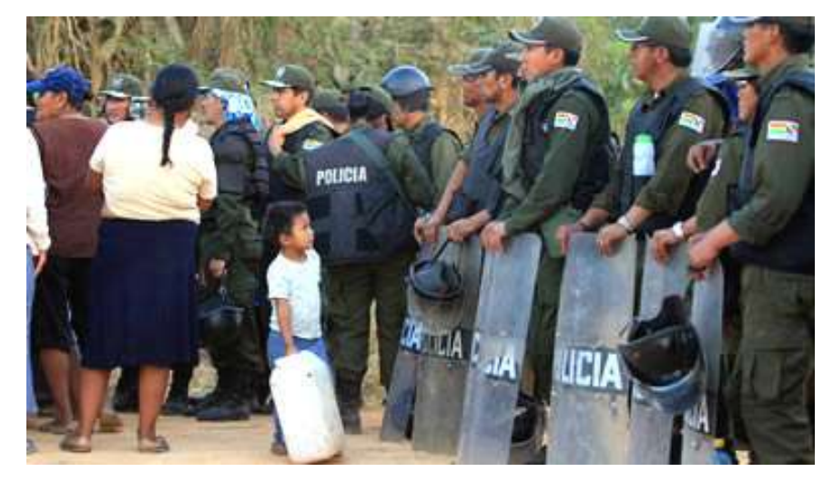
MARCHERS INCLUDING CHILDREN AND BABIES DENIED ACCESS TO NEARBY WATER.