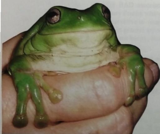
Photo :- Litoria caerulea Green Tree Frog from environmental campaigners Bernie and Dot Laughlan http://www.adisite.org